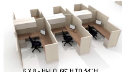
6 X 8 - HI-LO 66" H TO 54" H