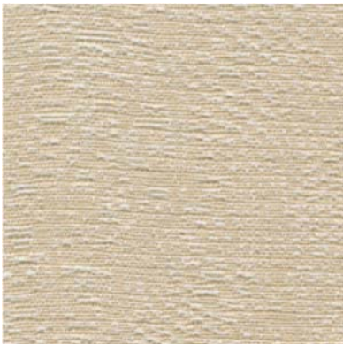
Panel Fabric—Melody Silt