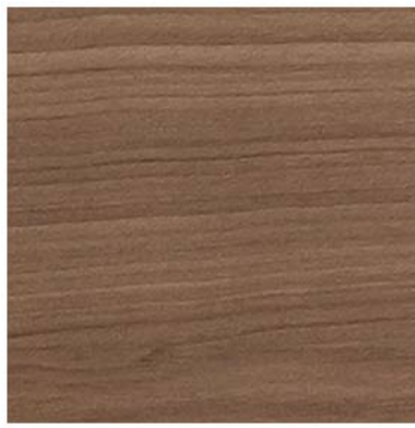
Surface Laminate—Winter Cherry