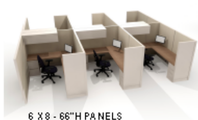
6 X 8 - 66" H PANELS