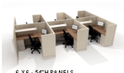
6 X 6 - 54" H PANELS