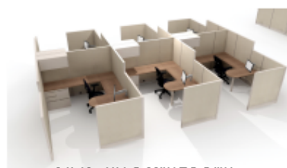
8 X 10 - HI-LO 66" H TO 54" H