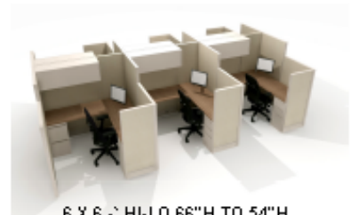
6 X 6 - HI-LO 66" H TO 54" H