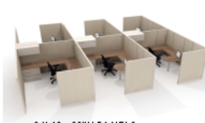
8 X 10 - 66" H PANELS