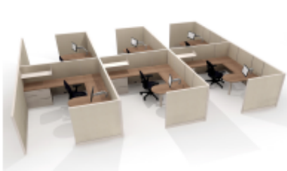
8 X 10 - 54" H PANELS