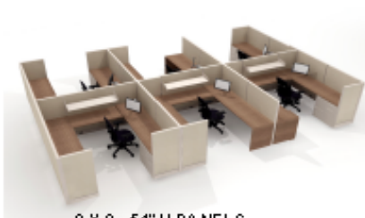
8 X 8 - 54" H PANELS