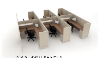
6 X 8 - 54" H PANELS