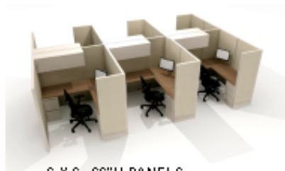
6 X 6 - 66" H PANELS