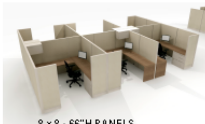
8 X 8 - 66" H PANELS