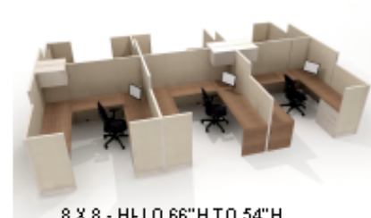
8 X 8 - HI-LO 66" H TO 54" H